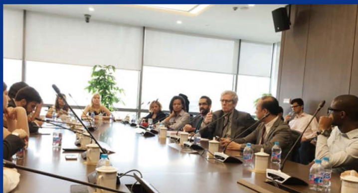
VISIT TO NEW DEVELOPMENT BANK