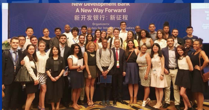
THE FIRST ANNUAL MEETING OF NDB MODEL BRICS SUMMIT