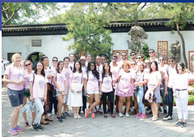
CULTURAL TRIP TO SUZHOU