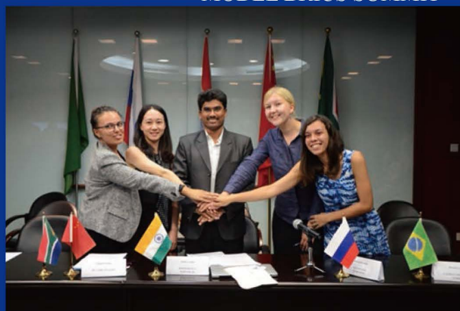
MODEL BRICS SUMMIT